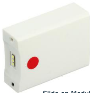
Slide on Module